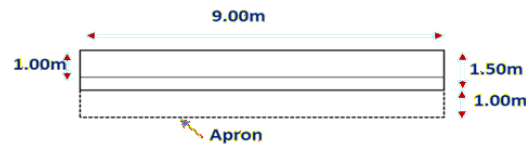
Plan of the Gabion Wall